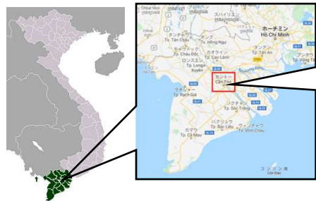
Can Tho University